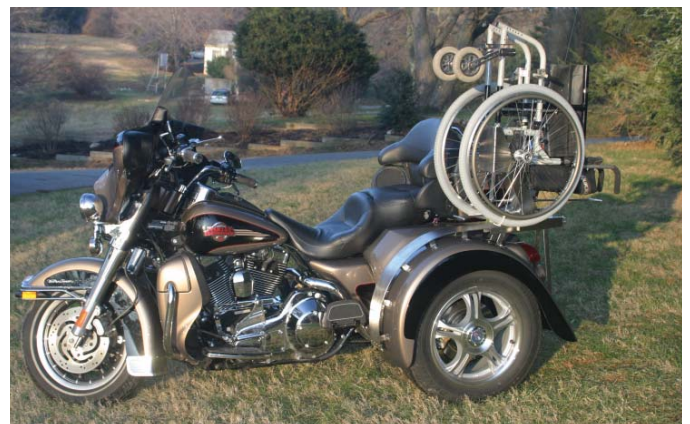
Here is a wheelchair lift on a custom trike. The wheelchair is attached to an arm on a track that lifts it onto the fender. The lift gives riders wheels on their bike or in their chair and is the product of The Freedom Track, www.freedom-track.com .

Where is the Haus of Trikes located? The shop address is 36350 Dupont Boulevard (Route 113), Selbyville, Delaware 19975. Contact Jeff at 410-251-2146, info@hausoftrikes.com , or visit the website at www.hausoftrikes.com . ■