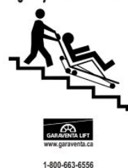
Emergency Evacuation Device

Whether at work or at home, people who use a wheelchair face significant issues related to emergency planning. If you're a wheelchair user and live or work above the first floor, your emergency plans should take into consideration the possible absence of an elevator or lift. There are several devices that can assist in such an evacuation. One option is the Evacu-trac emergency evacuation chair by Garaventa . This chair is designed for use by one person to transport a wheelchair user down stairs without additional help. Information about the chair is available on their website ( www.garaventa.ca/et/ ) or by calling 866-824-8314.